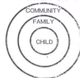
CHILD SUPPORT SYSTEM

Of course, the way to stop the cycle is to lessen the demand. The power to do so is not within me right now, but I can surely write about it.*